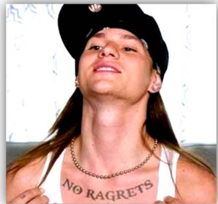
"NOT EVEN A LETTER"

Depending on the size and placement of the tattoo, a treatment can last just a few minutes. Treatments are done about every five to six weeks to allow for the ink particles to clear.